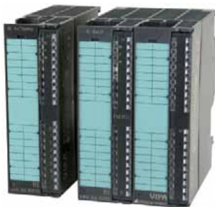
R355 Controller Module

If the cyclical vaporizing period is constant, oscillation can be filtered out by activating the oscillation suppression function. This is accomplished by means of narrow-band filtering in order to remove the signal component with the selected period, which is then disregarded for measuring signal control. The temperature values for the displays are not influenced (see figure 2). Periods can be selected within a range of 0.3 to 25 seconds, and the filter remains inactive for other setting values.