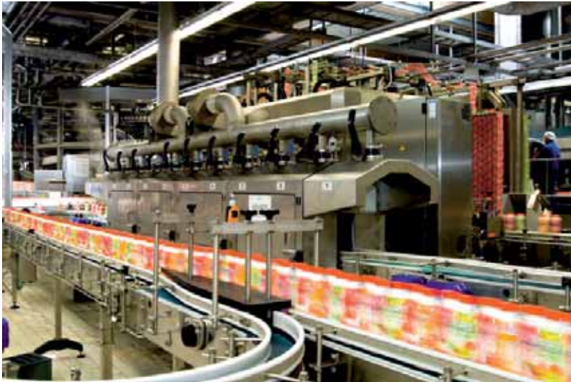
Steam Tunnel, Part of a Bottling Line

Gossen Metrawatt supplies module for controlling moderate temperatures of an \text{H}_2\text{O}_2 – hot air mixture.